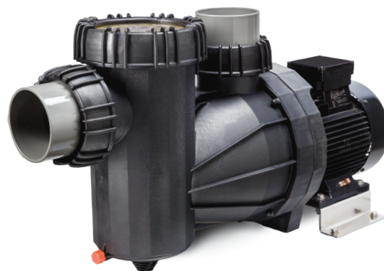
Model 95-X (w/ TEFC Motor)