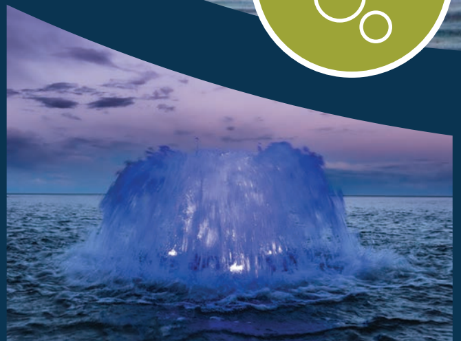
Pair with optional WaterGlow Lighting.